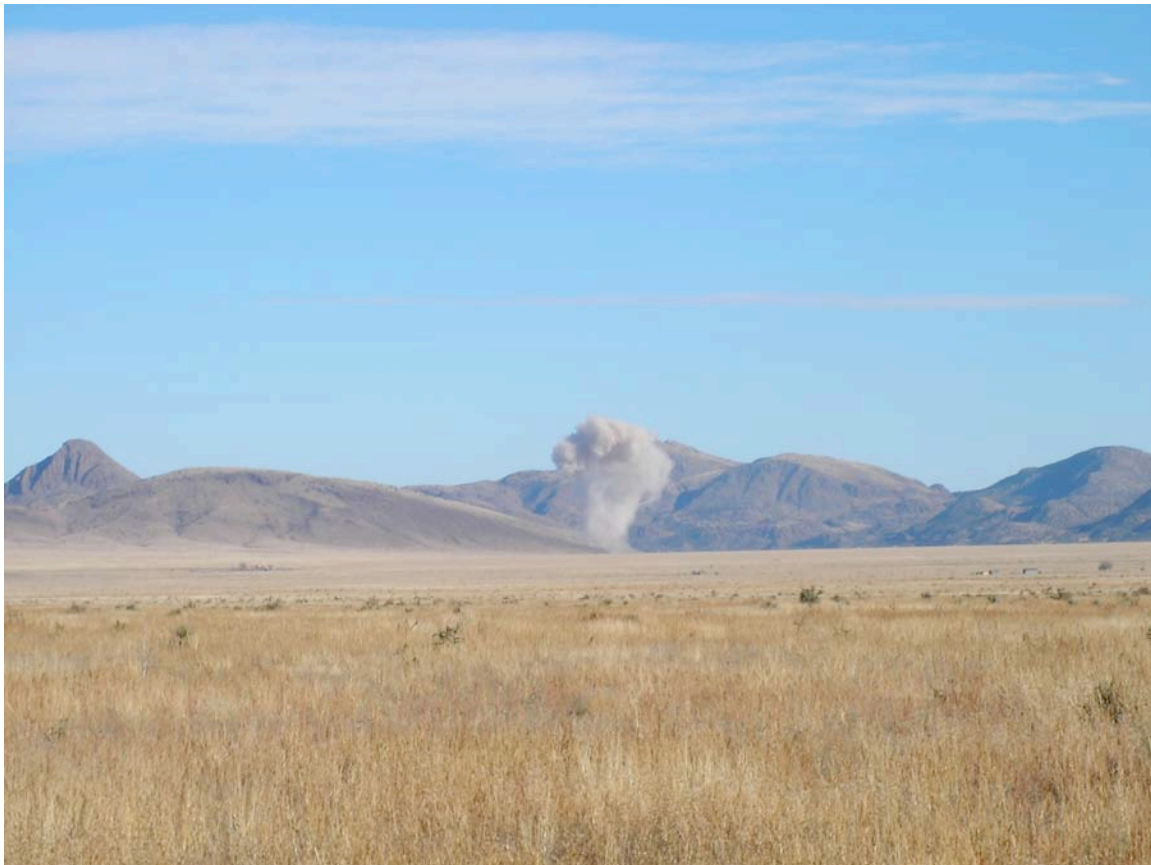
Fig. 6. Looking east toward the EMRTC site a few seconds after an explosion there.

Terrain: Flat Soil Composition: Dirt Ground Cover: Grass Terrain Shielding: Not much. Line-of-sight to Sandia Obvious RFI sources: 0.5 miles from Hwy 60. Sandia peak transmitters, M mountain transmitters. Only about 5 miles from Magdalena, with some shielding to that direction.