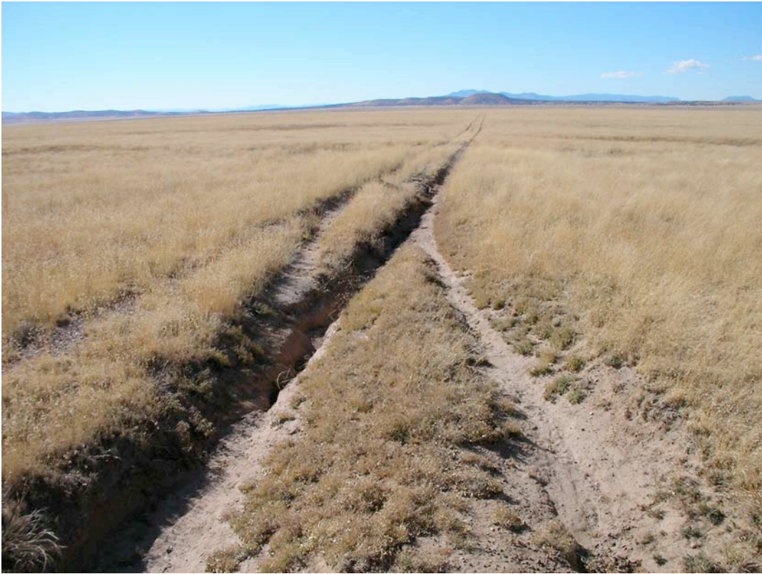
Fig. 5. Looking west from site (4).

Terrain: rolling hills, locally flat in places Soil Composition: Dirt Ground Cover: Grass, Terrain Shielding: Good Obvious RFI sources: None. Very empty.