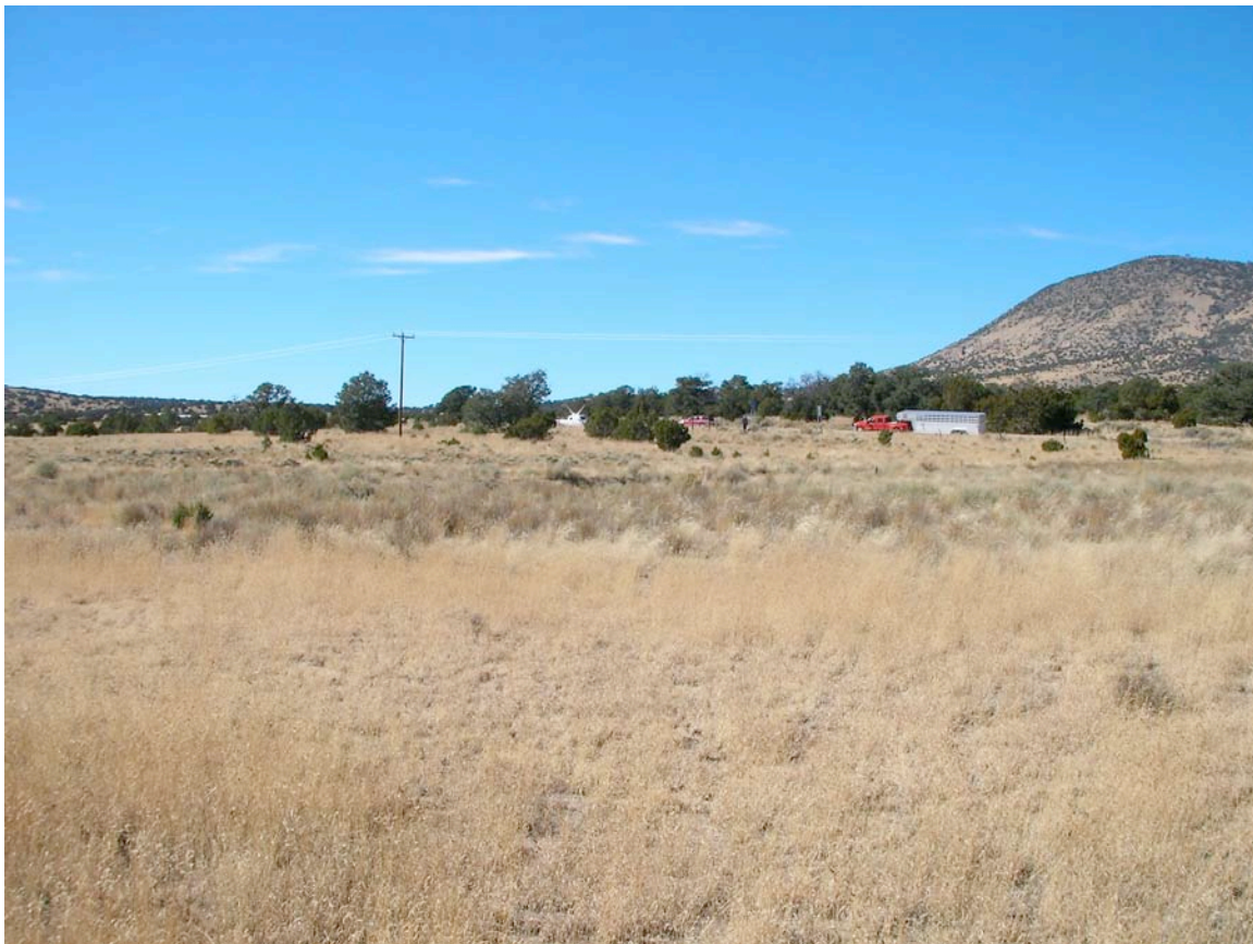
Fig. 4: Looking west back toward Hwy 12.

Obvious RFI sources: About 6 miles from Datil, Hwy 12 0.25 miles.