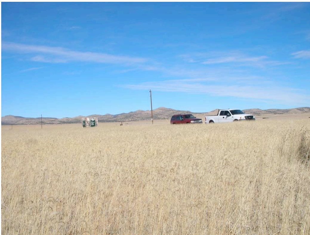
Fig. 2. View from site (1) looking to the north-east.

Terrain: Flat Soil Composition: Dirt Ground Cover: Grass Terrain Shielding: Excellent – hills to the north and east, Sandia Peak not visible Obvious RFI sources: 1 house about 0.5 miles distant