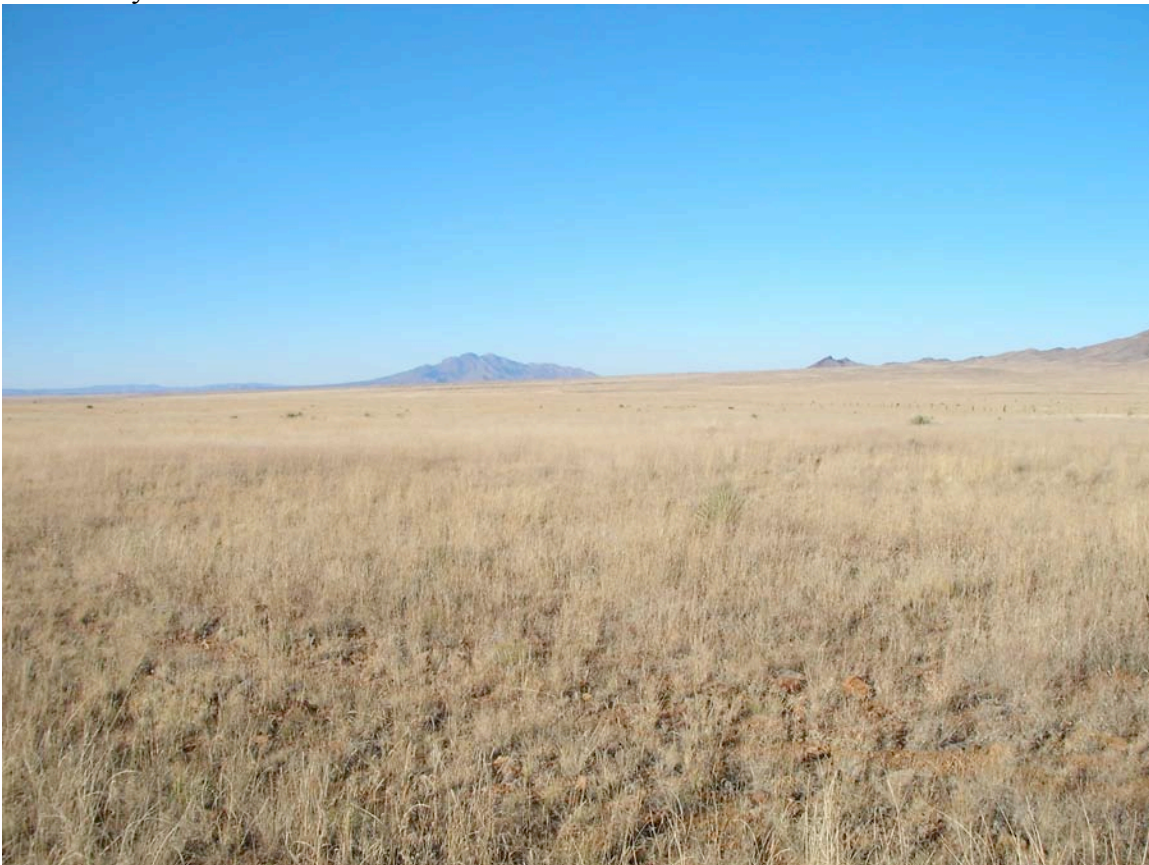
Fig. 7. Looking north from site (6).

Terrain: Flat Soil Composition: Dirt Ground Cover: Grass Terrain Shielding: Some, Sandia not line of sight. Obvious RFI sources: 1 mile from Hwy 60. Sandia peak transmitters, M mountain transmitters. High tension power lines ~ 2miles away. Detonations from EMRTC a few miles away?