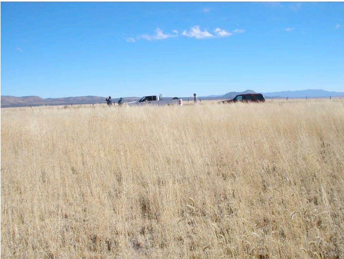
Fig. 3. Looking east from site (2).

Obvious RFI sources: 1 house about 1 miles distant, Hwy 60 1 mile distant.