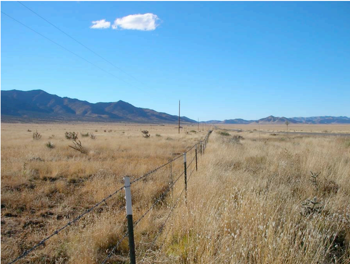
Fig. 8. Looking East along the fence at the boundary of site (7).

Obvious RFI sources: <0.25 miles from Hwy 60. Sandia peak transmitters, M mountain transmitters. A few miles from EMRTC. A few houses some miles distant.