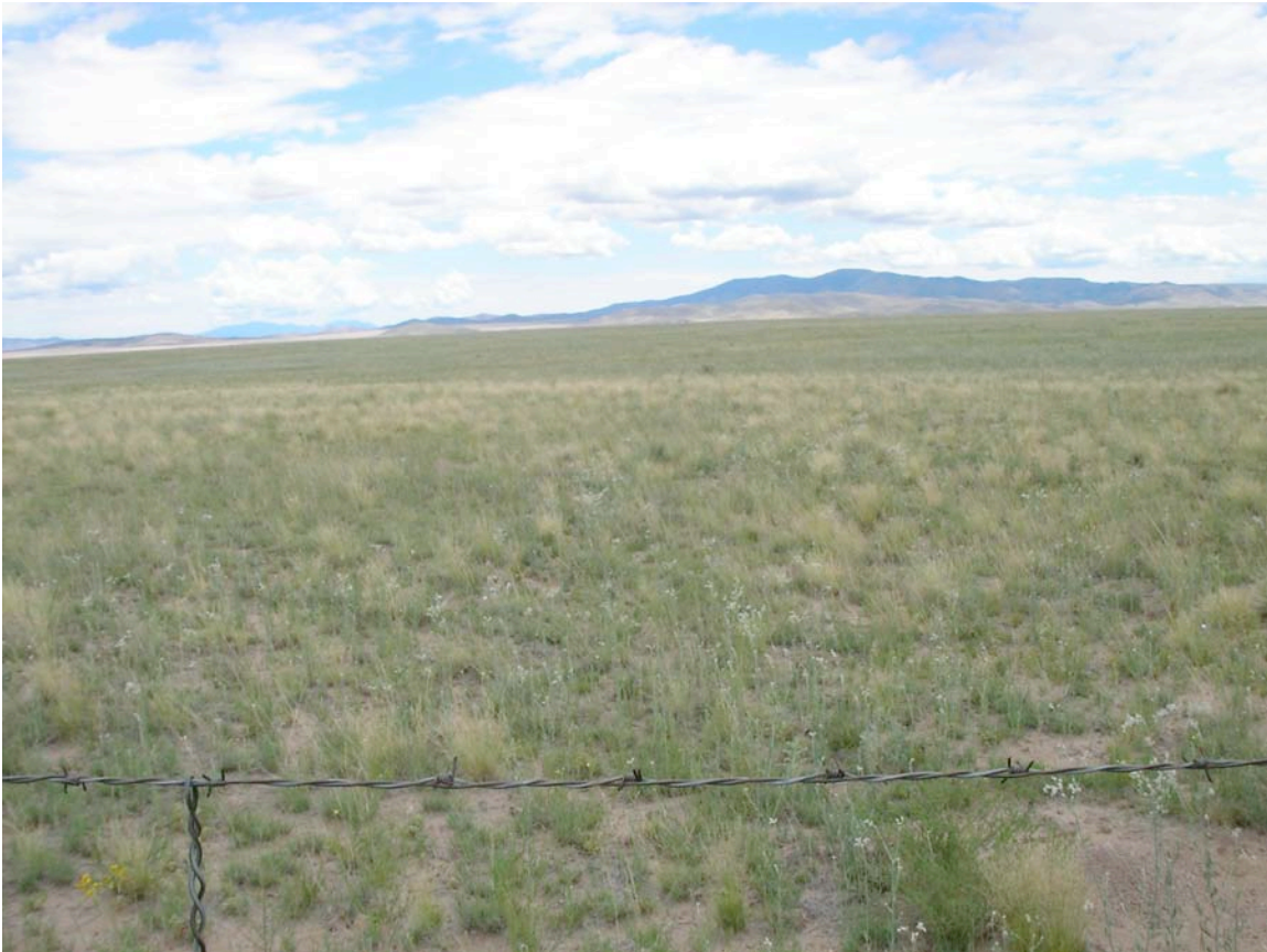
Fig. 5. Looking east from HM site.

Obvious RFI sources: Ranch House 3 miles distant. Very empty and even FM reception poor.