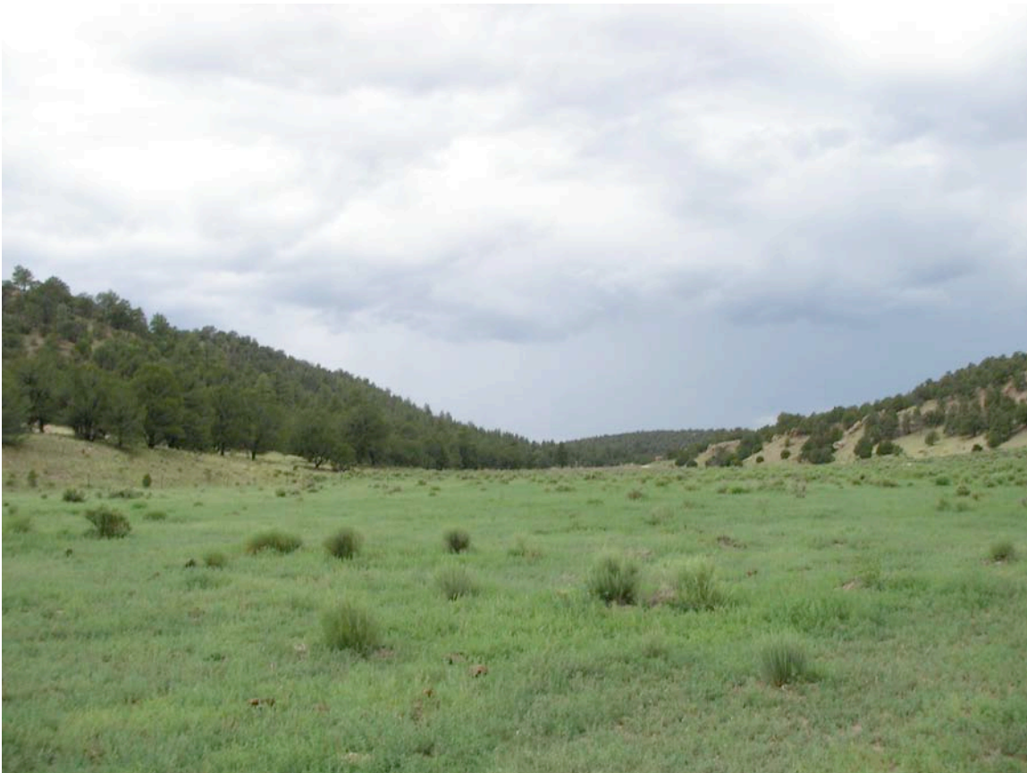
Fig. 7. Looking south from site AM.

Other Notes: Beautiful valley, but could have drainage issues. Little tight but a station would fit.