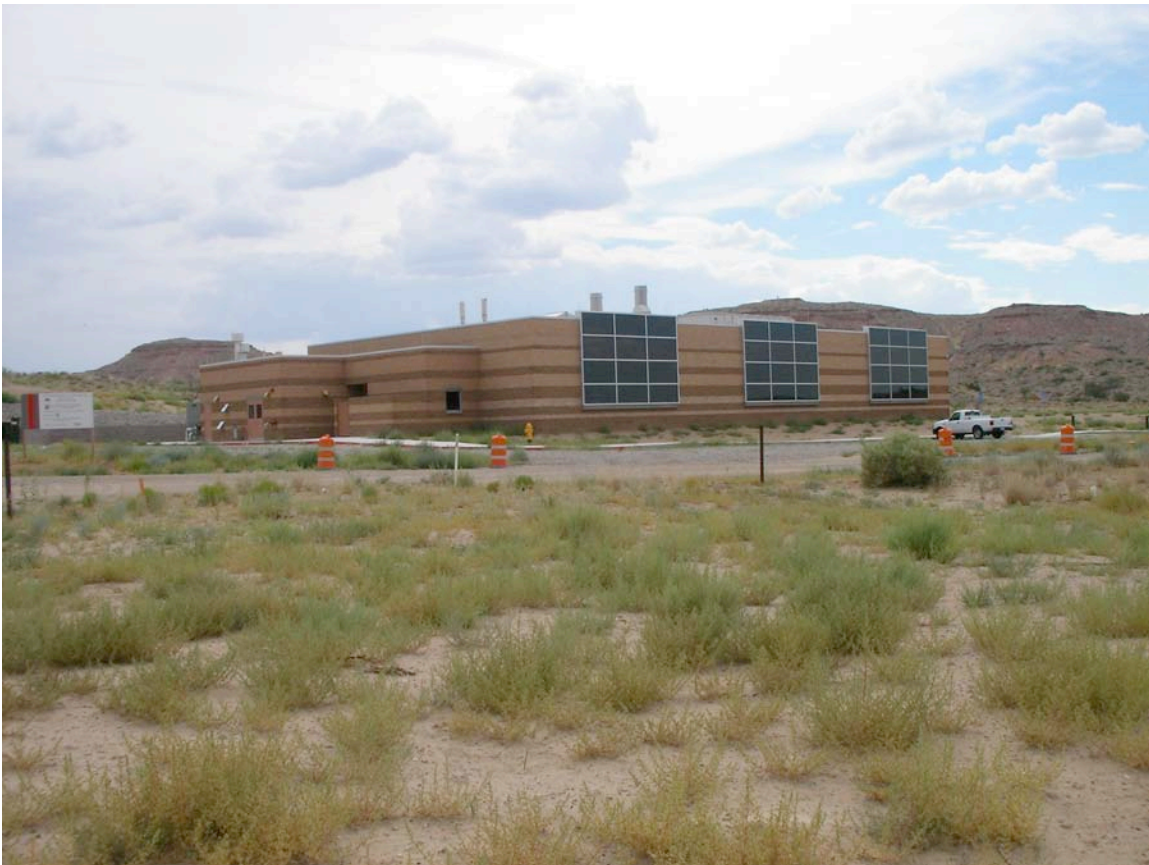
Fig. 10. Looking across the leach field at the currently empty new building at SV.

Obvious RFI sources: I25 < 0.25 miles, ~50 people working around SV headquarters.