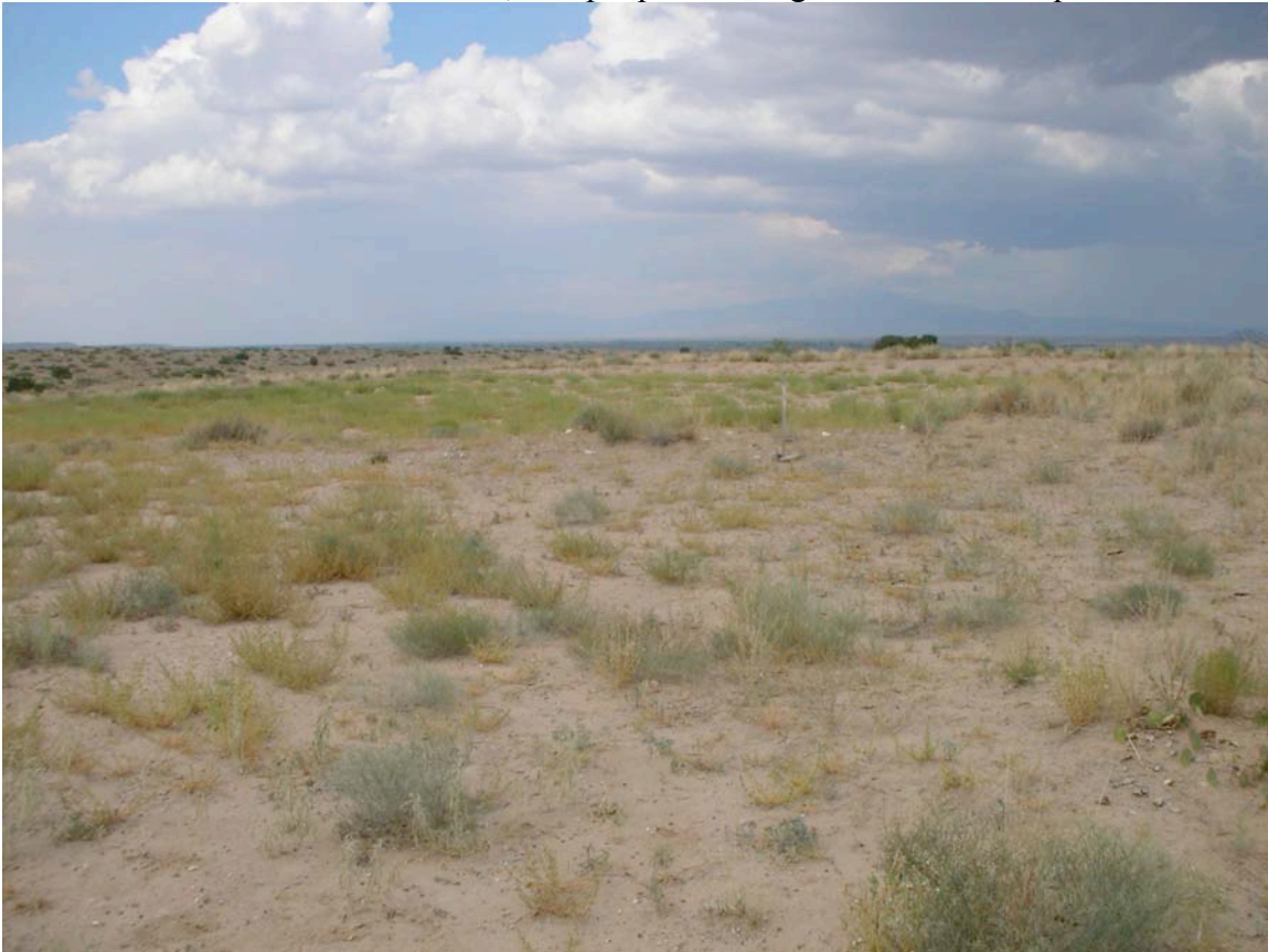
Fig. 11. Looking north from the mesa off Jack Well road.

Obvious RFI sources: I25 ~ 4 miles, ~50 people working around SV headquarters.