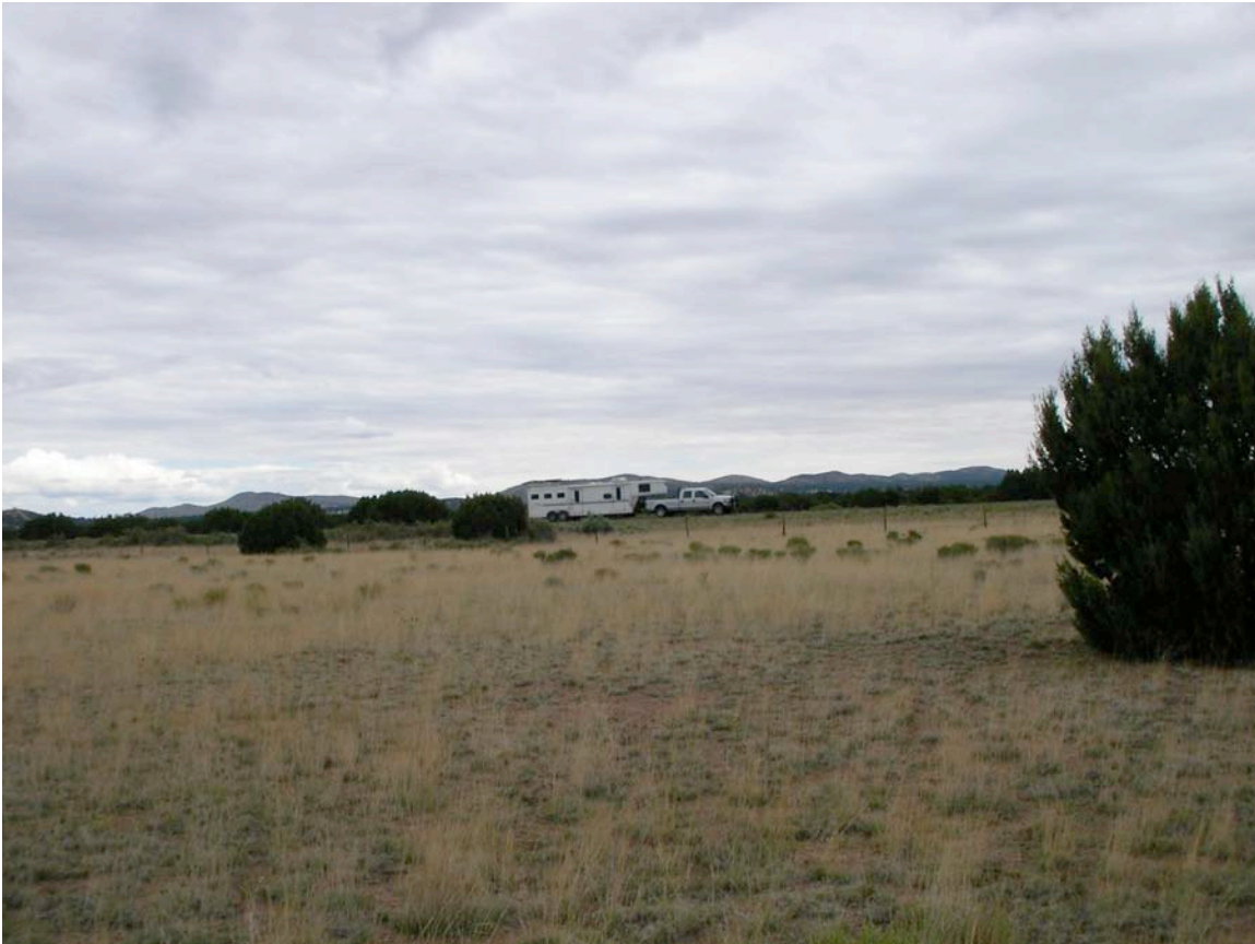
Fig. 3. Looking north from TM site.

Obvious RFI sources: 1 house about 2 miles distant, Hwy 60 <0.25 mile distant.