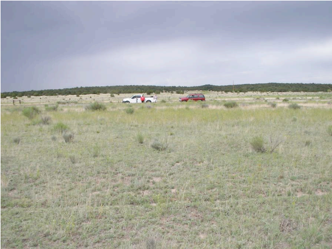
Fig. 9. Looking north at Hwy 603 from PT site.

Obvious RFI sources: ranch houses (2) about 0.5 miles away