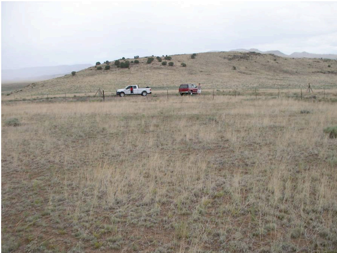
Fig. 6. Looking north from the center of HS site.

Obvious RFI sources: ranch house 0.5 miles distant.