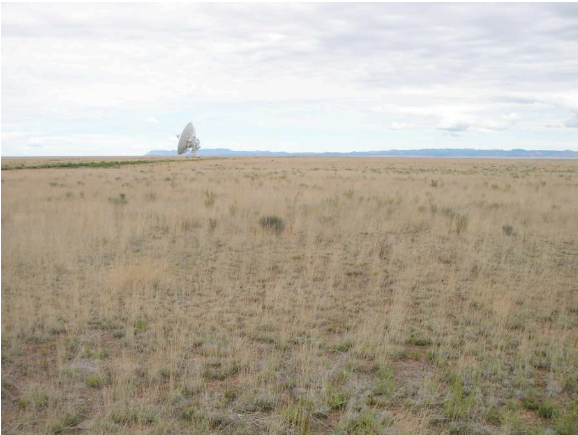
Fig. 2. View from site (1) looking to the west down the east arm of the VLA.

Obvious RFI sources: 1 house about 5 miles distant